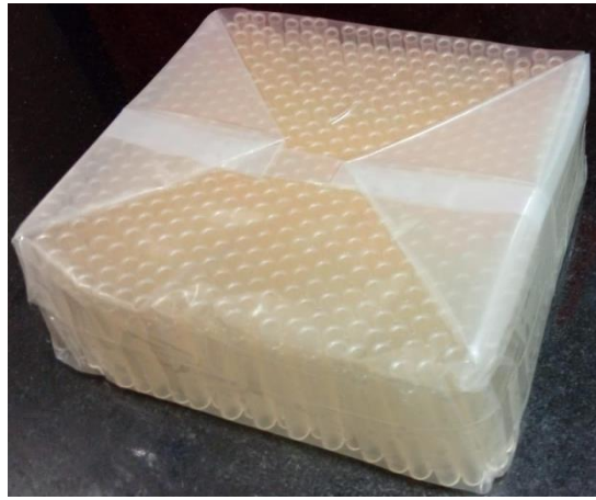
Primary packing method of Break off Valve Tubes (Qty.: 500 nos.)