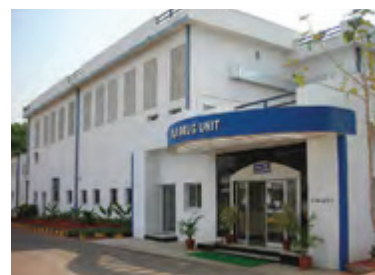
Kanagala Facility, Belgaum