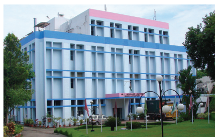
Akkulam Facility, Thiruvananthapuram