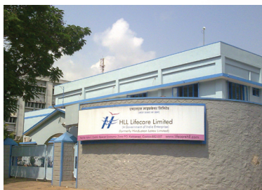
Kakkanad Facility, Cochin

HLL Factory at Haridwar is engaged in manufacture of Ayurvedic and Unani Medicines. Lactohil – a herbal product for lactating mothers is manufactured from this facility and being exported by HLL – International Business Division (IBD).