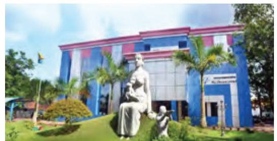
HLL's Corporate headquarters at Thiruvananthapuram, Kerala.

a small picturesque town located in the south western part of India. A revolution called HLL that swept the length and breadth of the country. A revolution that helped to rein in the alarming population growth and enhanced the quality of life of families. A revolution that eventually sparked off many a movement and idea, bringing quality healthcare and prosperity at the doorstep of millions. The revolution resulted in creating a healthier India, with a record of 194 Mn couple year protections (CYPs*) during the past five decades. We call it the Pink Revolution. The revolution, today, has reached every corner of the country as well as many parts of the world, addressing public health challenges and bringing good health and happiness in its wake.