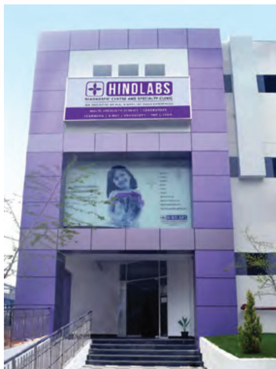
Hindlabs Diagnostic Centre

Besides its major strengths such as affordable pricing, fully automated NABL accredited labs and equipment, and supremely skilled manpower; HINDLABS has garnered critical experience in large projects with various State Governments and the National Health Mission. The division has associations with the National Health Missions of Maharashtra, Assam, and Uttar Pradesh and has tie-ups with the state governments of Kerala, Orissa, Karnataka, and West Bengal. It also works with CGHS, AIIMS, AAI, BHEL, Ministry of Labour and Employment Labour Welfare organisation in various states.