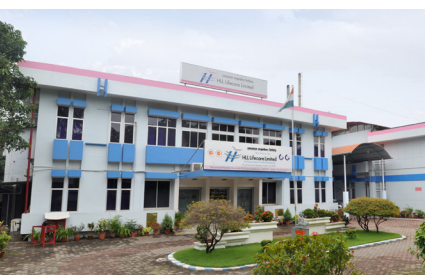
Peroorkada Facility, Thiruvananthapuram

The tableting of Emergency Contraceptive pills started in 2003. Manufacturing facility for Centchroman bulk drug was added in 2004.