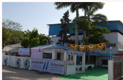
Pharma Facility, Indore