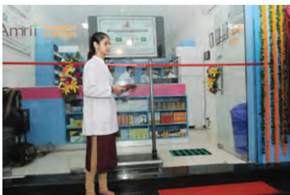
Amrit Pharmacy, AIIMS, Delhi

AMRIT stands for Affordable Medicines and Reliable Implants for Treatment, representing a cost effective model of chain pharmacies. It's a flagship programme by the Ministry of Health & Family Welfare implemented by HLL, displaying a strong commitment to reduce the cost of treatment or out-of-pocket expenditure for the patients. Lakhs of patients benefit from this initiative. HLL expanded the AMRIT outlets to various Central Government-funded Hospitals, Regional Cancer Centres, and PMSSY aided hospitals across different states in India. As on date, HLL has established AMRIT pharmacies across 28 states/UTs in India. Both Generic and Branded drugs are dispensed through these outlets.