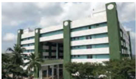
Super Speciality Block, Thiruvananthapuram Medical College