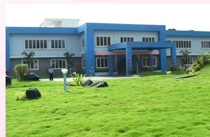
Irapuram Facility, Cochin