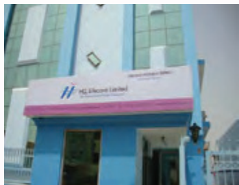
Manesar Facility, Gurgaon