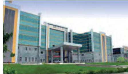
Salem Medical College

HITES also provides procurement and consultancy services to Government of India, State Governments and other institutions for procuring a range of healthcare and hospital products, equipment and devices. It is designated as a National Procurement Support Agency (NPSA). With a team of highly qualified and experienced professionals, it has proven expertise to undertake consultancy assignments including bid process management, procurement of goods, as well as project planning and monitoring. HITES has widened its gamut of operations to provide wide range of procurement services with accuracy, speed and utmost transparency. Today it extends its expertise to clients in building qualitative and reliable healthcare facilities in India and other developing countries.