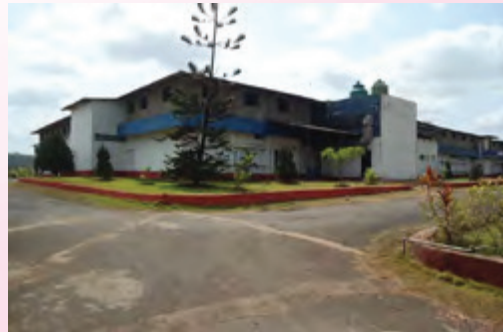
Goa Antibiotics and Pharmaceuticals Limited