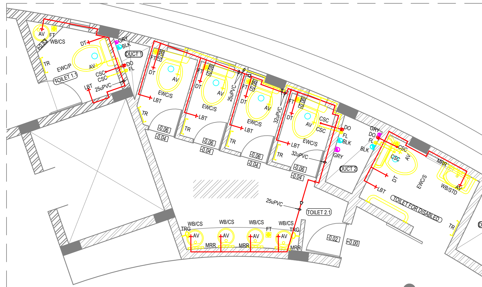
PLUMBING LAYOUT SHOWING WATER SUPPLY LINES IN TOILET 1.1 AND 2.1 IN GROUND FLOOR SCALE 1:30