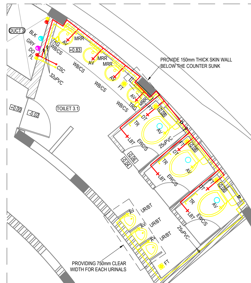
PLUMBING LAYOUT SHOWING WATER SUPPLY LINES IN TOILET 3.1 IN GROUND FLOOR SCALE 1:30