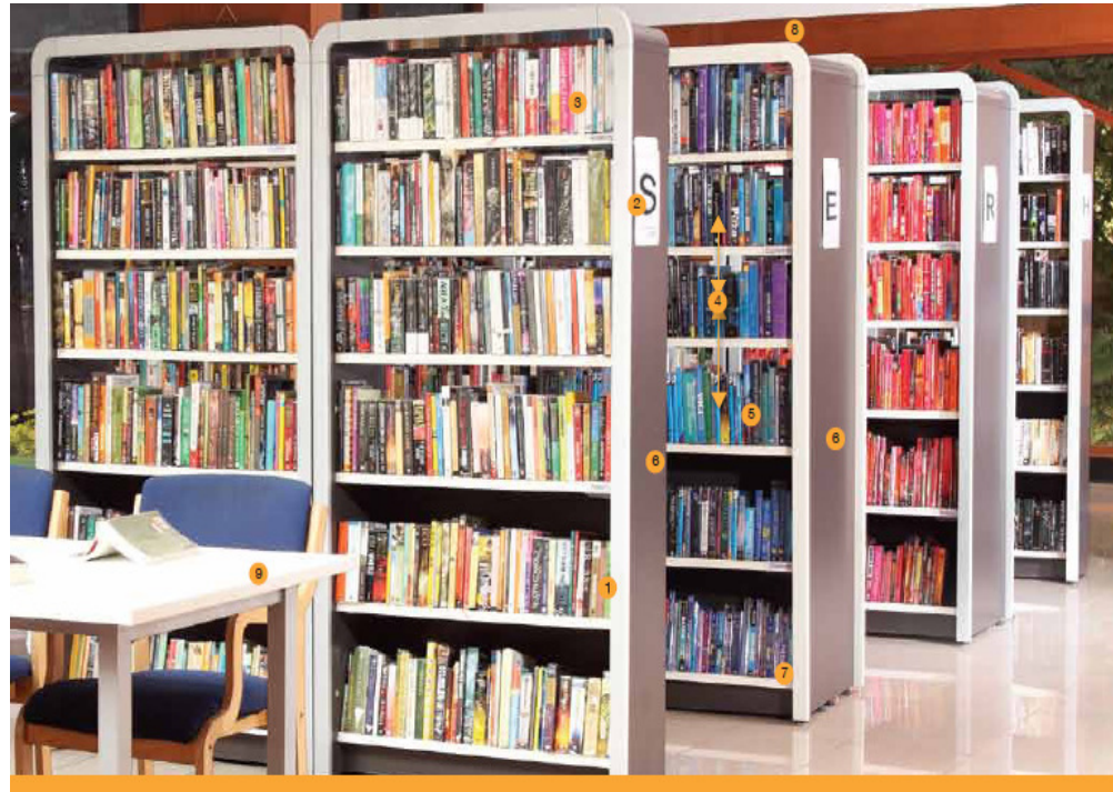
Library open book shelf