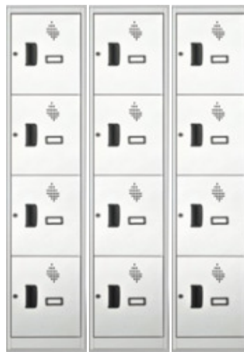
Personal Locker unit