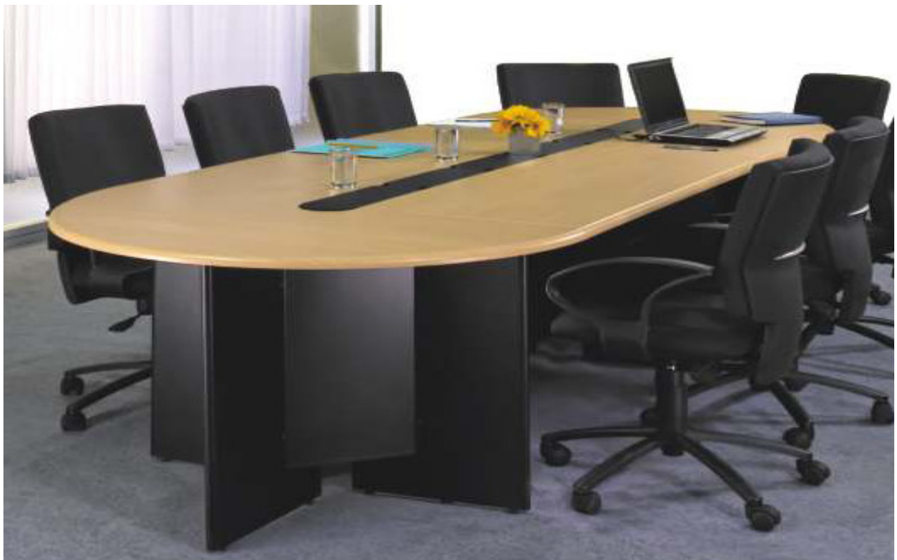
Oval shape conference table