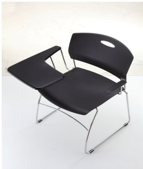
Student chairs (Vinyl)