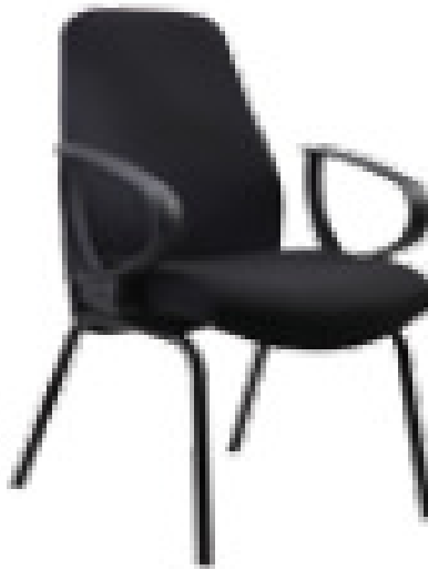
Library – Lecture hall chairs