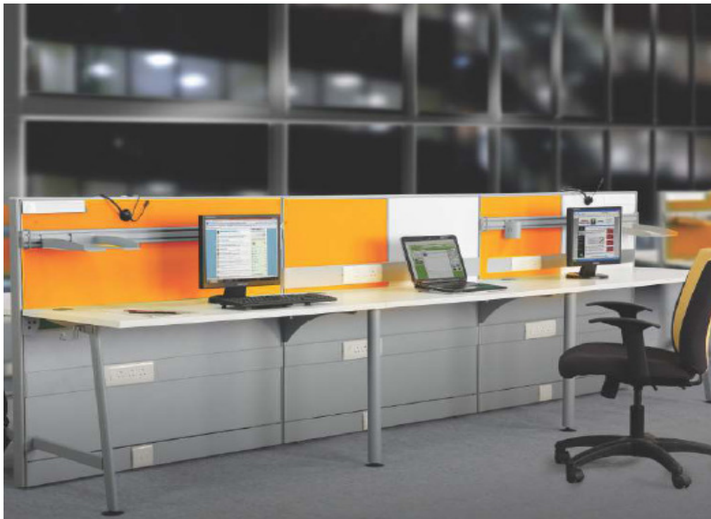
Linear computer seating