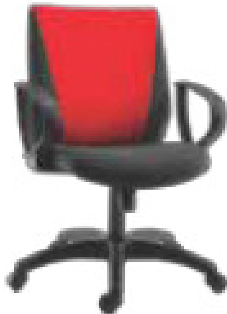
Executive/Conference room chairs