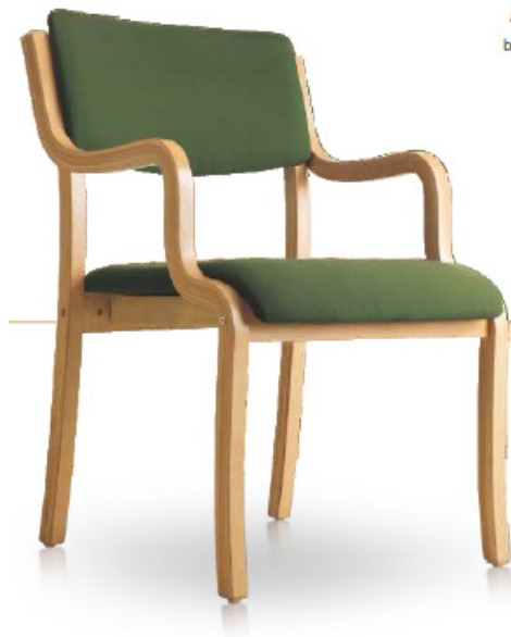
Library room chairs