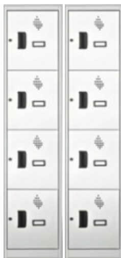
Personal Locker unit