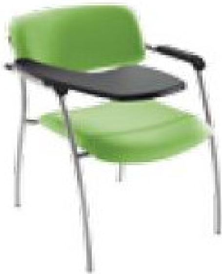
Student chairs (Fabric)