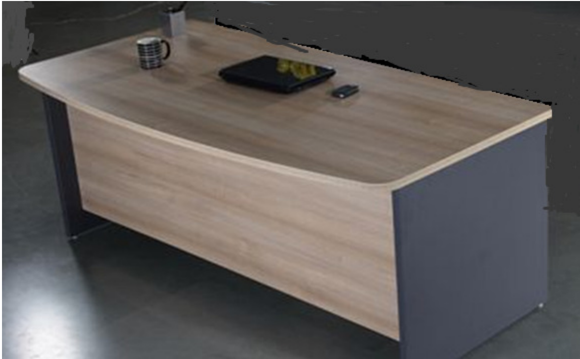
Office table with side pedestal unit