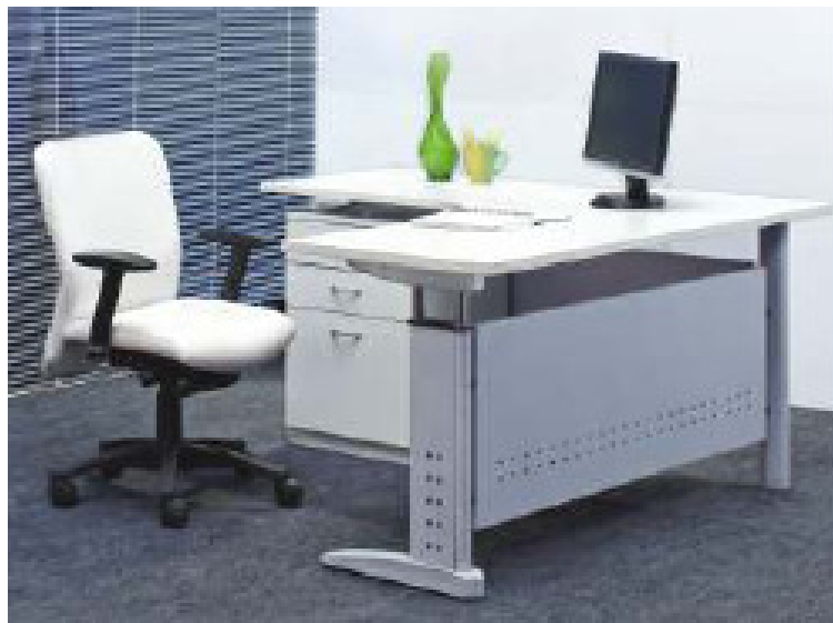
Office table with side pedestal unit