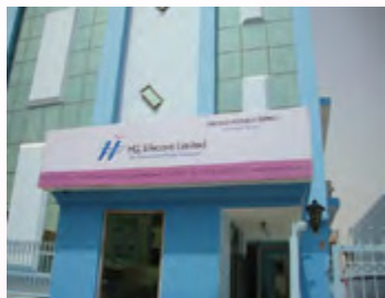
Manesar Facility, Gurgaon