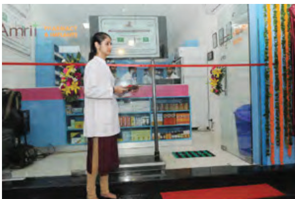
Amrit Pharmacy, AIIMS, Delhi

HLL Pharmacy and HLL Opticals are comprehensive medical retail outlets, started in partnership with State Governments / Medical Institutions, wherein all type of essential medicines, surgical disposables, implants and ophthalmic products are provided at a discount from the prevailing market price. It is a successful PPP (public-public partnership) model implemented by HLL.