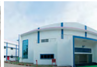
Unipill Block, Kanagala