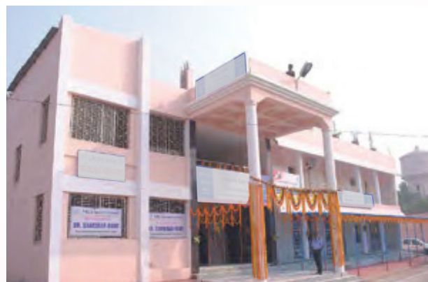
HLL Pharmacy & Surgicals, Cuttack

This is a chain of drug stores established near a Government Hospital in a PPP model. Reasonably priced quality generic medicines are made easily accessible and available through these stores.