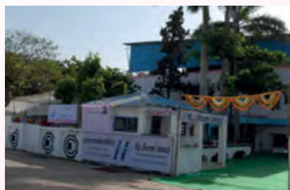
Pharma Facility, Indore