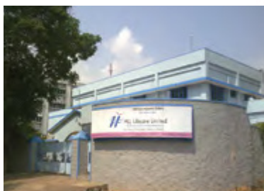
Kakkanad Facility, Cochin

HLL's Pharma Production Facility at Indore commenced operations in 2010. The unit supplements the existing production facility of KFB in the area of women's healthcare products. The facility also focuses on Iron & Folic Acid tablets manufacturing and has the capability to manufacture a range of pharma products which include formulations such as tablets, capsules and ORS.