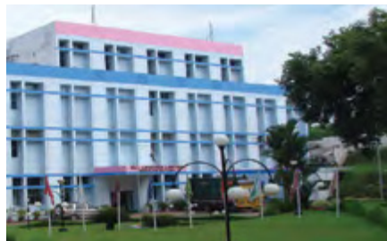
Akkulam Facility, Thiruvananthapuram