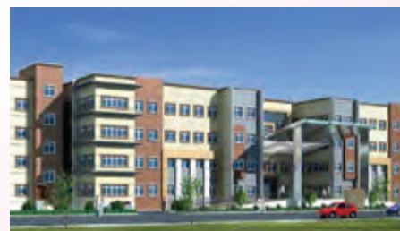
Madurai Medical College