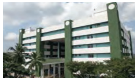
Super Speciality Block, Thiruvananthapuram Medical College

HITES also provides procurement and consultancy services to Government of India, State Governments and other institutions for procuring a range of healthcare and hospital products, equipment and devices. It is designated as a National Procurement Support Agency (NPSA). With a team of highly qualified and experienced professionals, it has proven expertise to undertake consultancy assignments including bid process management, procurement of goods, as well as project planning and monitoring. HITES has widened its gamut of operations to provide wide range of procurement services with accuracy, speed and utmost transparency. Today it extends its expertise to clients in building qualitative and reliable healthcare facilities in India and other developing countries.