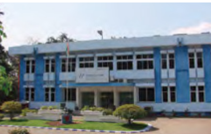
Peroorkada Facility, Thiruvananthapuram

The Kanagala Facility in Belgaum, Karnataka (KFB) commenced operations with production of condoms in 1985 using Japanese technology.