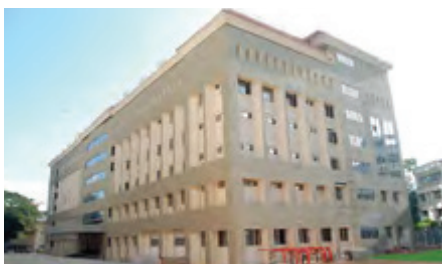
Bangalore Medical College