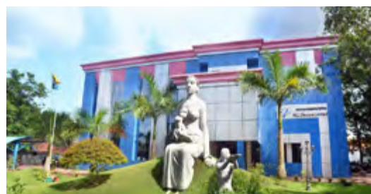
HLL's Corporate headquarters at Thiruvananthapuram, Kerala.

a small picturesque town located in the south western part of India. A revolution called HLL that swept the length and breadth of the country. A revolution that helped to rein in the alarming population growth and enhanced the quality of life of families. A revolution that eventually sparked off many a movement and idea, bringing quality healthcare and prosperity at the doorstep of millions. The revolution resulted in creating a healthier India, with a record of 189 Mn couple year protections (CYPs*) during the past four decades. We call it the Pink Revolution. The revolution, today, has reached every corner of the country as well as many parts of the world, addressing public health challenges and bringing good health and happiness in its wake.