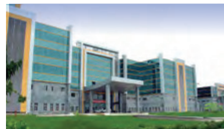
Salem Medical College