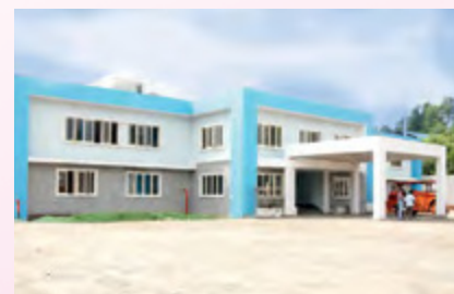
Irapuram Facility, Cochin