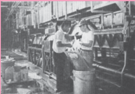
A Japanese engineer explains the working of the Moulding Machine to a HLL engineer, in 1969.