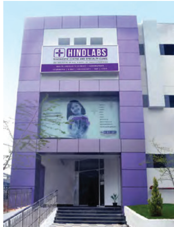
Hindlabs Diagnostic Centre

With a robust network of more than 100+ eminent radiologists, HINDLABS Tele Radiology service is offering cost-effective reporting solutions to various public and private healthcare organisations in the country. Through a synergy of patient focus, great people and modern technology, HLL provides flexible tailor-made solutions for Hospitals that can support the health institutions to deliver diagnostic reports quickly, reducing a great deal of delay in patient care at affordable cost.