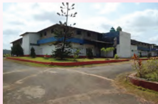
Goa Antibiotics and Pharmaceuticals Limited