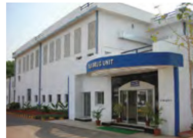
Kanagala Facility, Belgaum