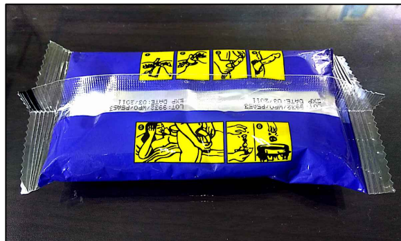
40 condoms inside (size 55mmx57mm)