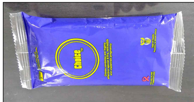
40 condoms inside (size 55mmx57mm)